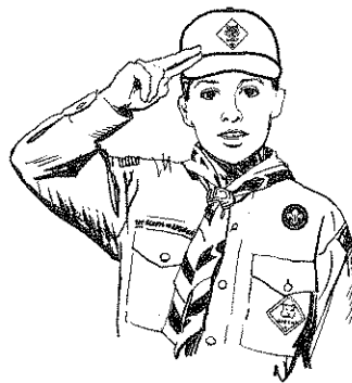
Cub Scout salute

The salute is made by joining the index and middle fingers of the right hand (holding the other fingers with the thumb) and touching them to the cap visor or forehead. The hand is held the same as for the Cub Scout sign, except the two fingers are together.