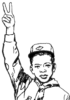
Cub Scout sign

The Cub Scout sign is made with the right arm held high and straight up above the shoulder, with the index and middle fingers forming a V.