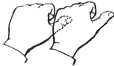
Left-hand thumb grip

To form a Living Circle, Cub Scouts (and leaders) face inward in a close circle. With the right hand, each person gives the Cub Scout sign. They turn slightly to the right and extend left hands into the circle. Each thumb in the circle is pointed to the right, and each person grasps the thumb of the person on his left, making a complete Living Circle handclasp. The Promise, Law of the Pack, or motto can then be repeated.